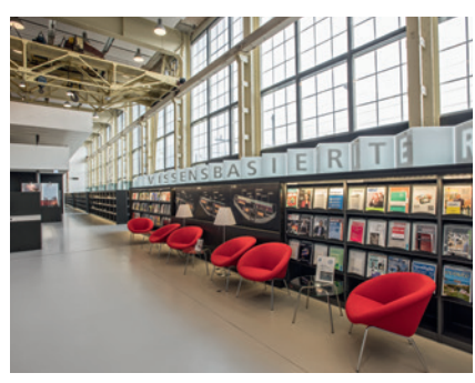
The courses will take place at the SML Campus, and the participants are welcome to use our modern infrastructure.