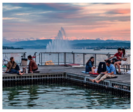
e: © Zürich Tourismus